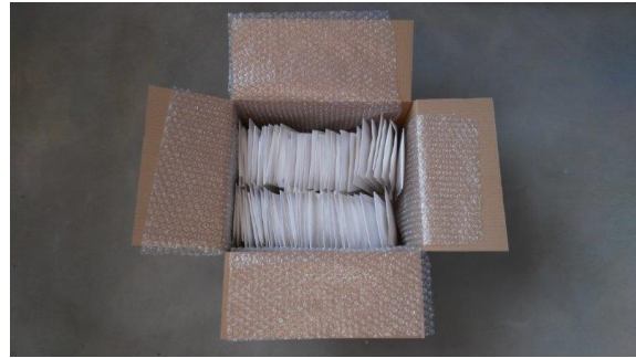
2 – Inner Filler and 1 – Outside Box

Picture: Polystyrene balls and Air-pack (Flo-pak)